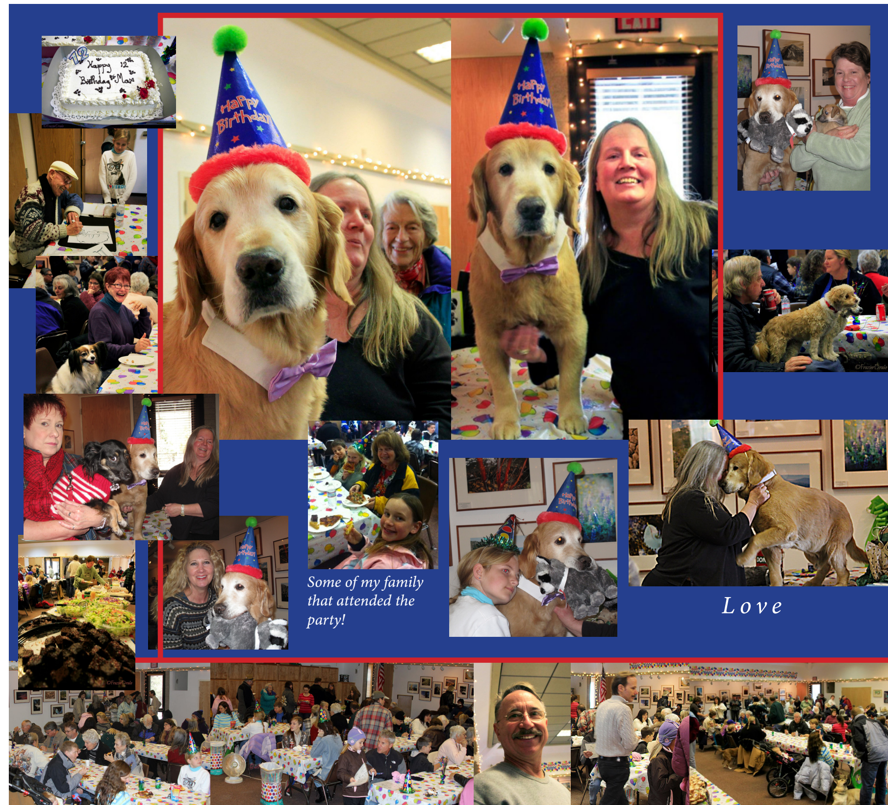
Some of my family that attended the party!