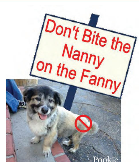
The Puppy Shower has NO Pookie Mueller out garnering campaign.