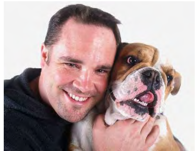
Whites of eyes Mouth open Leaning away from the hug

Beneath each photo of the human-dog hug is a listing of the dog’s stress indicators. These indicators clearly show the dog’s participation in the hug is less than enthusiastic, and in some cases could put the human in a dangerous situation.