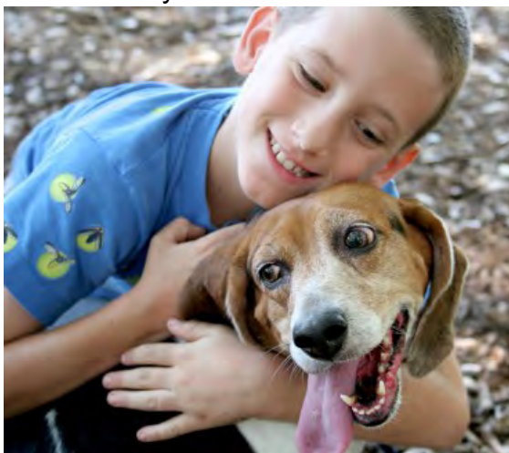
Panting, mouth open Whites of eyes Leaning away from the hug

fast, vigorous tail wag, usually involving the entire rear end, and when sitting or lying down, his tail will be thumping on the floor. Notice that Baxter’s ears are up, and his eyes are bright. His mouth is open in a relaxed, loose manner, and his tongue is not hanging out in a panicked pant.