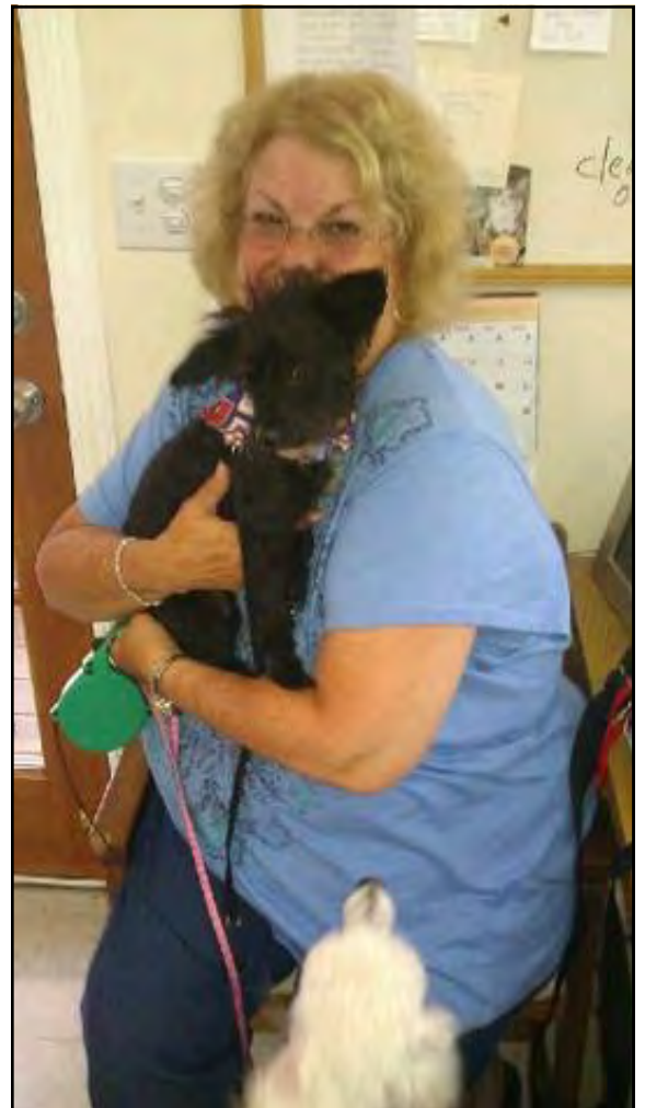
Adoption day at ARF